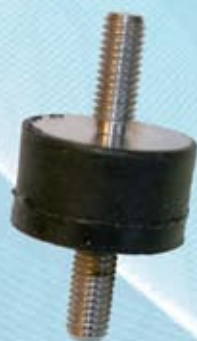
Rubber feet for secure mount of the scale